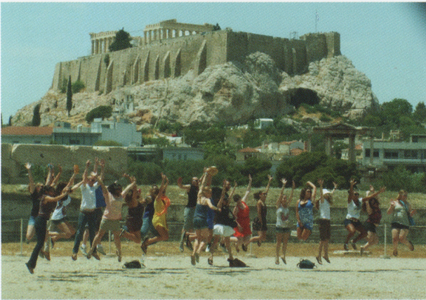
SDSU Classics and Humanities majors on study program in Greece Summer 2010